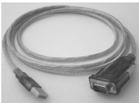
Converter Cable, 400 030