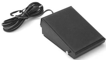
Footswitch, 400 020

Electronic Accessories specially developed for the VisiLED Controller MC 1500.