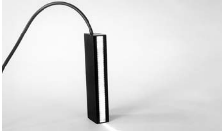
6" LED Lightline, A25081