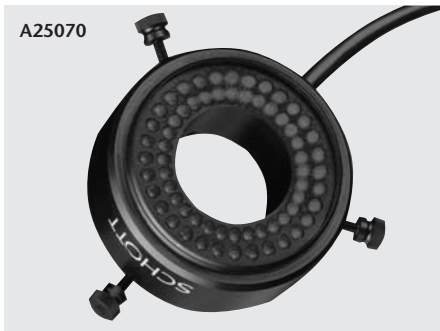
Mini LED Ringlight, A25070