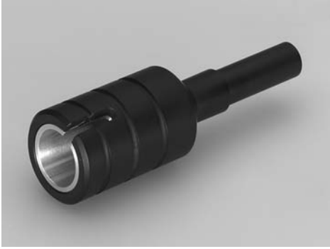
Universal Input Adapter, 158 320