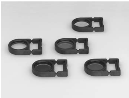
Insert filter only for KL 1500 LCD