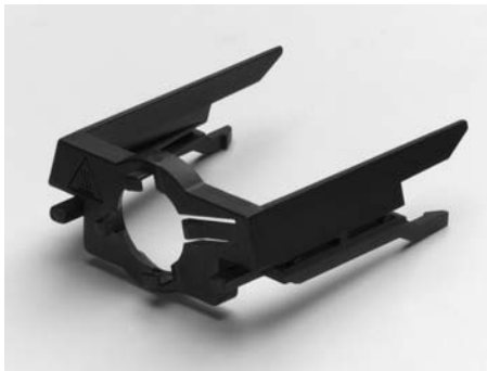
Insert filter holder KL 200