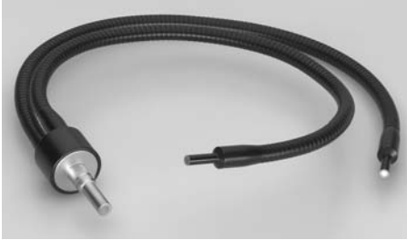
Gooseneck light guide bifurcated