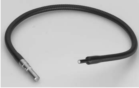
Gooseneck light guide