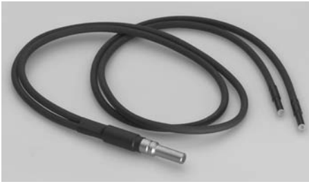
Flexible light guide 2 branch