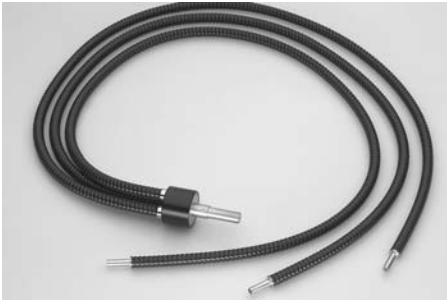
Flexible light guide 3 branch