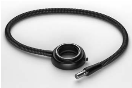
Annular ringlight Jumbo 66 mm