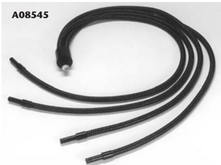
Quad Bundle, A08545