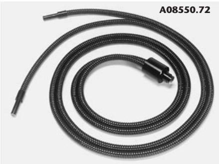
Dual Bundle, A08550.72