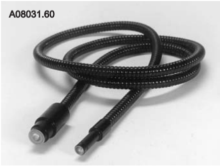
Single Bundle, A08031.60